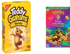
Teddy Grahams Bunny Grahams