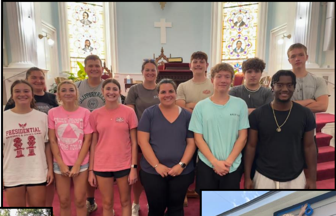
Youth Mission trip in Savannah, GA