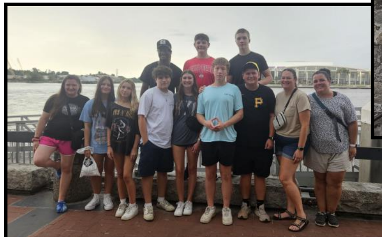
Savannah, GA (left & above)