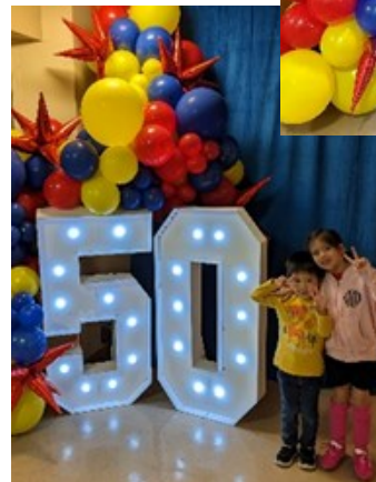
Photos from the 50th Anniversary Celebration